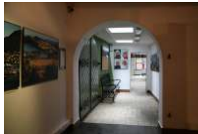
Tony Halik's Travellers Museum in Toruń

Tony Halik's Travellers Museum in Toruń, was first opened on the 24th January 2003 on Elżbieta Dzikowska's initiative. The building was carefully renovated and adapted to standards. At the back of the building an exhibition hall was added. The hall exhibits photographic works of polish travellers, from all over the world.