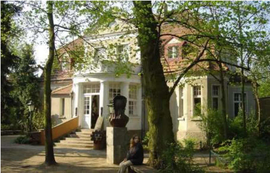
Arkady Fiedler's Museum Literary Workshop