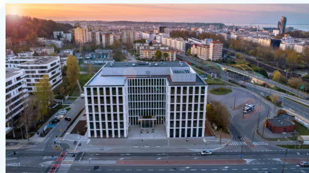
K2 office building by Vastint.

The building, with a leasable area of 11,400 m 2 , was built in an exposed point of the city, at ul. Kielecka. K2 has been designed in accordance with the LEED environmental certification criteria.