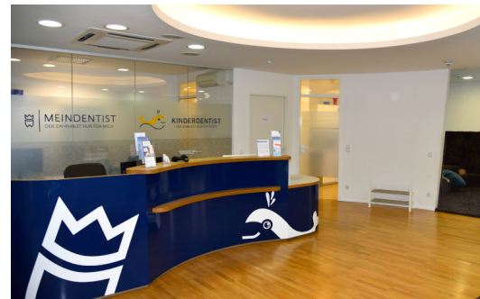
Medicover Stomatologia invests in Germany.