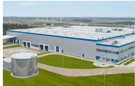
Kongsberg factory in Brześć

Panattoni, a leader in the industrial real estate market in Europe, has completed the expansion of the Kongsberg factory, a Norwegian manufacturer with a global reach in the automotive industry.