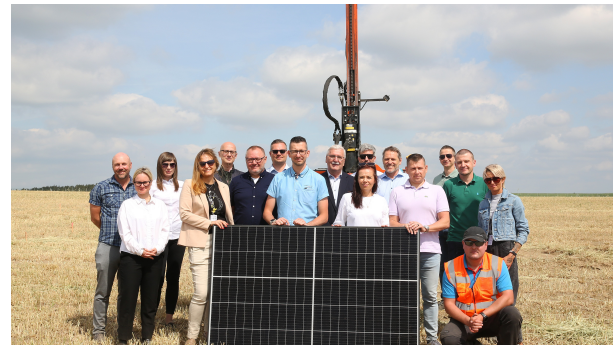
Opening ceremony for the commencement of the construction of the IKEA photovoltaic installation

IKEA Industry Zbąszynek officially began the construction of one of the largest solar farms for private use in Poland and Europe. Solar panels with a total capacity of 19 MW will be installed on the premises of IKEA Industry plants in Babimost and Zbąszynek. The investment will save energy costs and lower the climate footprint.