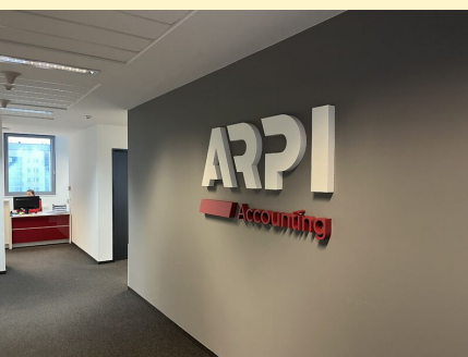
fot. Arpi LinkedIn