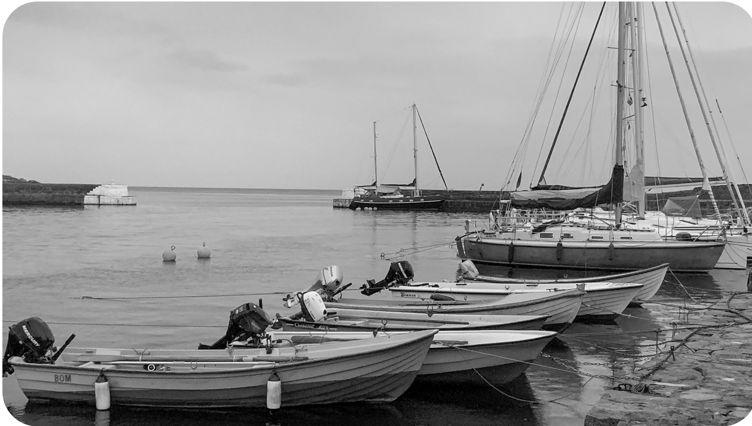
Christiansø marina, Denmark