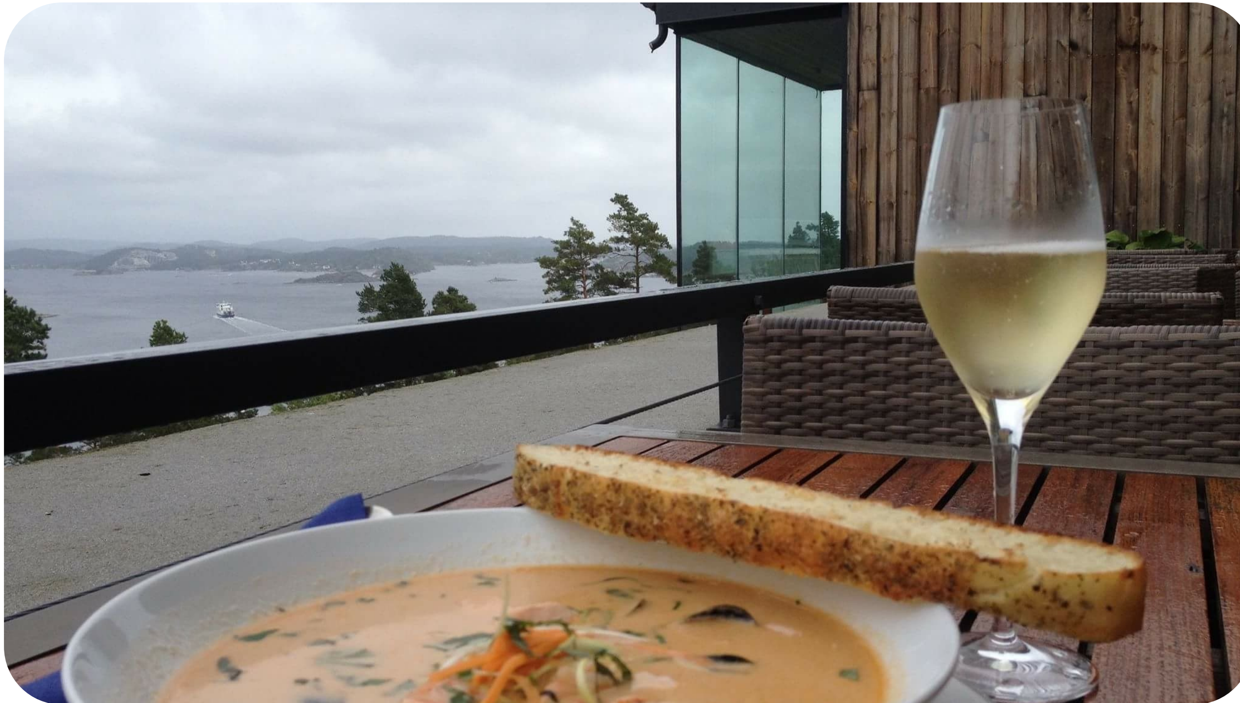
Kragerø, South of Norway