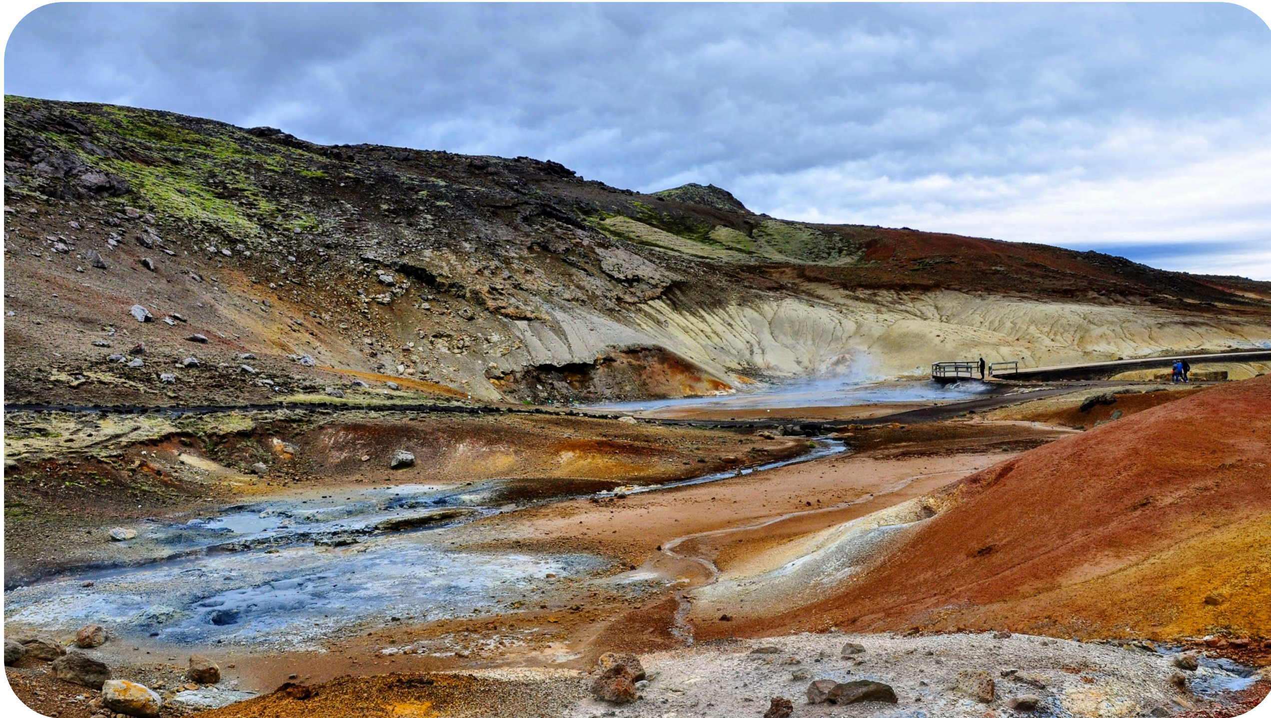
Reykjanes Peninsula in Iceland