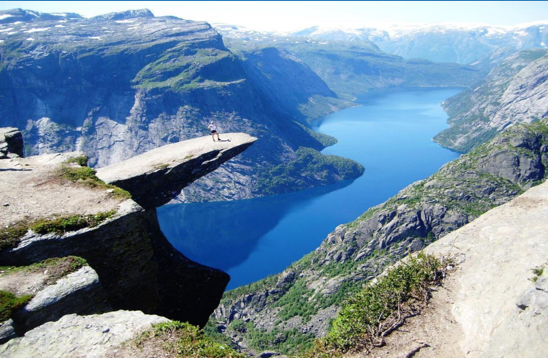
Trolltunga. Ringedalsvatnet and the glacier Folgefonna on top of the mountains