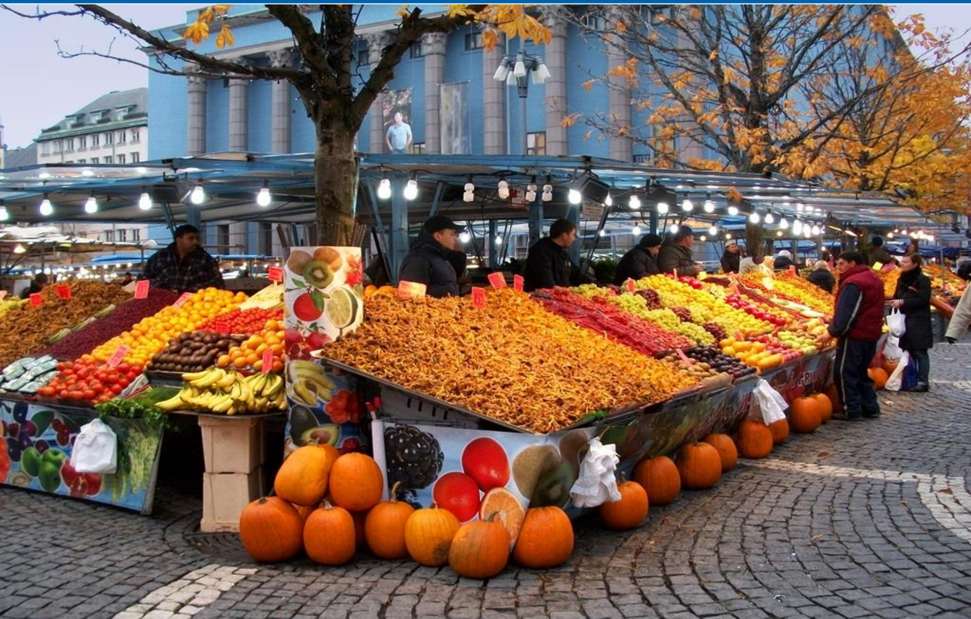
Autumn in Stockholm on Hötorget market with the Swedish forest gold – chantarelles – in the foreground on the disk.