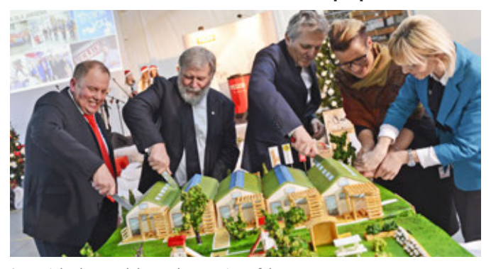
A special cake to celebrate the creation of the new day care centre in Namysłów

Owing to tri-partite cooperation, Namysłów will benefit from an innovative day care centre, which will also pursue activities aimed at supporting parents. The project was initiated by Fundacja Ekologiczna Wychowanie i Sztuka "ELEMENTARZ" [The "PRIMER" Education and Arts Ecological Foundation]. Namysłów Commune contributed an attractive plot of land for the venture, and the project will be financed by THE VELUX FOUNDATIONS, which donated over PLN five million for this purpose.