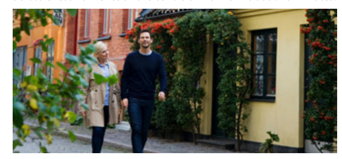
Malmö, Miriam Preis/imagebank.sweden.se

Southern Sweden is fantastically communicated with Poland – we can take an everyday, direct flights from Warsaw, Gdańsk, Katowice, Poznań to Malmö (Wizzair, with ticket prices starting from 39 PLN), or from Warsaw, Gdańsk, Kraków, Poznań and Wrocław to Copenhagen (SAS), from where through the bridge and tunnel across Oresund we reach the centre of Malmö in about 20 minutes.