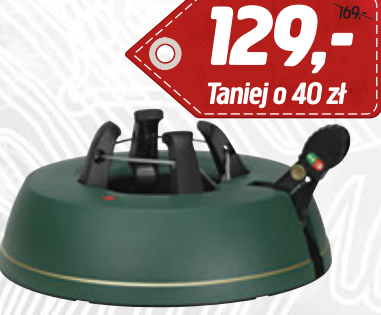
Stojak pod choinkę 946-739