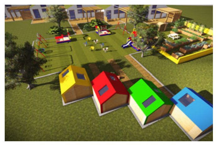
Visualization of a new integrated day care centre in Namysłów, fot. Fundacja Elementarz

Owing to tri-partite cooperation, Namysłów will benefit from an innovative day care centre, which will also pursue activities aimed at supporting parents. The project was initiated by Fundacja Ekologiczna Wychowanie i Sztuka "ELEMENTARZ" [The "PRIMER" Education and Arts Ecological Foundation]. Namysłów Commune contributed an attractive plot of land for the venture, and the project will be financed by THE VELUX FOUNDATIONS, which donated over PLN five million for this purpose.